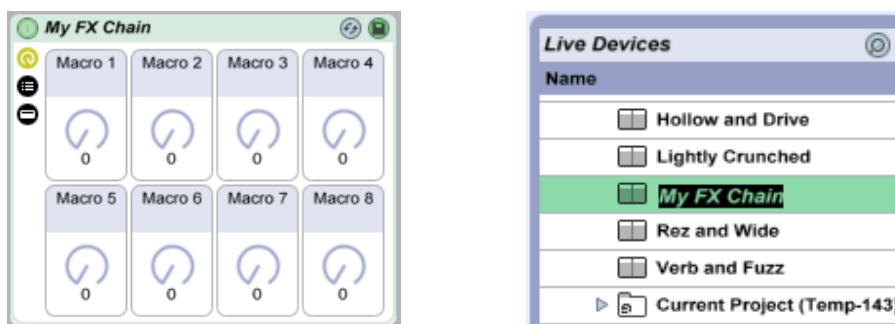
Saving a device in the default Ableton library

The MIDI tracks may contain Simpler instruments, Impulse Kits, drum racks and/or FX chains which can be saved into the Ableton library and the reused in any project of yours. To save these devices, simply open the library location in the file browser and then drag and drop the device to the browser. Alternately, you can click the 'save device' button on the top of the device's title bar. Once renamed, the device will appear in Ableton's library under the particular device's type.